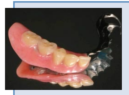
Figure 5a: Occlusal surface of the implant-supported removable partial denture (RPD).