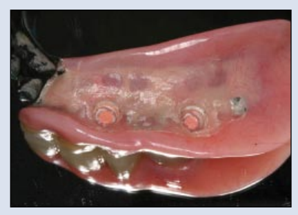
Figure 5b: Intaglio surface of the implantsupported RPD.