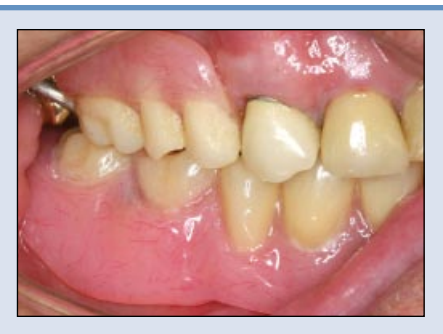
Figure 6: Intraoral view of the implantsupported RPD.

impressions were made with silicone impression material, and then the definitive maxillary and mandibular casts with 2 locater analogues were poured and mounted on a semiadjustable articulator (Whip Mix Co., Louisville, KY), using a facebow and a centric relation record. After the occlusal wax rims had been tried in on the record bases, the tooth arrangement was completed and heatcuring acrylic resin was processed in the laboratory ( Fig. 5 ). The maxillary conventional RPD and the mandibular implant-supported RPD, with 2 plastic retentive parts seated on the locater abutments, were delivered the same day ( Fig. 6 ).