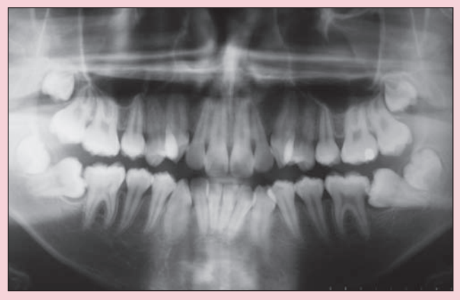
Figure 1: Panoramic radiograph of a boy with bilaterally impacted permanent mandibular second molars. Taurodontism was seen in both maxillary second molars.