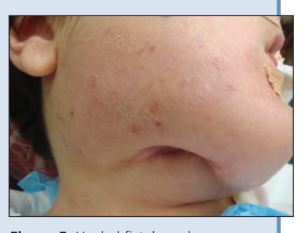
Figure 5: Healed fistula and defect at the inferior border of the mandible.

continued bone formation and endochondral ossification, leads to cortical bone thickening and cancellous bone sclerosis.