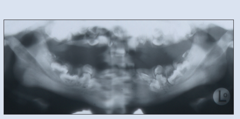
Figure 2: Panoramic radiograph in a patient with the infantile form of osteopetrosis.