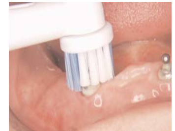
Cleaning with an Oral-B powered toothbrush