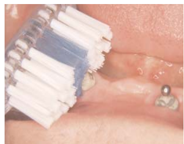
Brushing the side of the implant