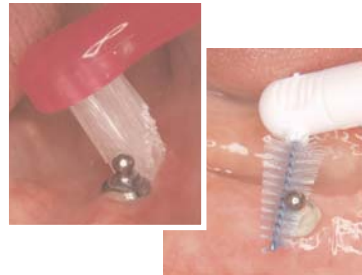
Cleaning with an end-tufted and interdental toothbrush