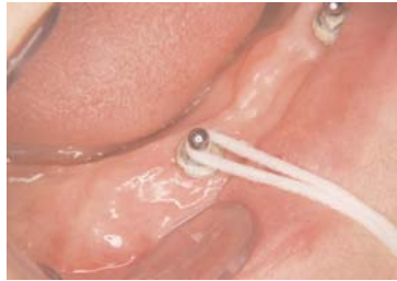
Flossing with thick floss

■ There are a variety of flosses available: thick, thin, flavoured, or waxed. Ask your dental professional which floss is best for you.