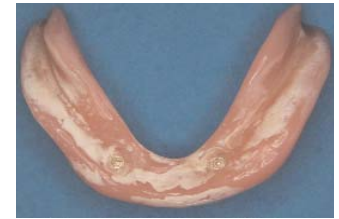
Dirty lower denture

If it is not clean, use a soft toothbrush to gently scrub off the debris. A denture toothbrush is too hard.