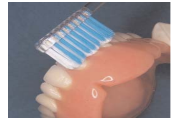
Brush with soft, regular toothbrush daily

Brush your dentures over a sink or a bowl filled with luke-warm water. This will prevent the denture from breaking if it falls.