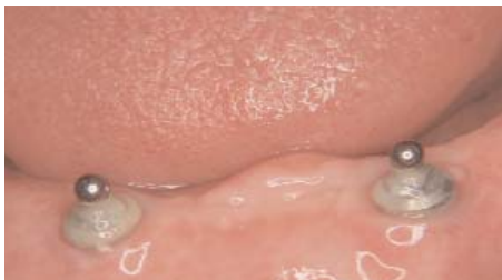
Food and germs surrounding both implants