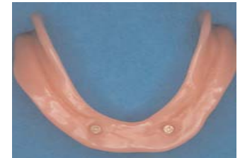
Clean lower denture

Brush your dentures over a sink or a bowl filled with luke-warm water. This will prevent the denture from breaking if it falls.