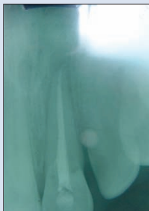
Figure 7: Radiographic view after root canal.