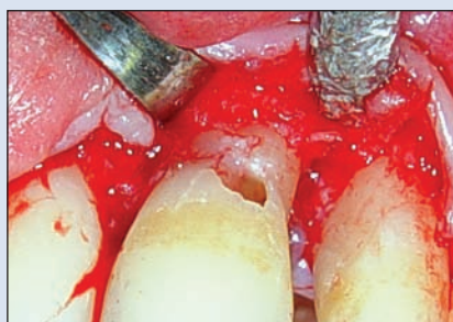
Figure 4: The extent of the resorption lesion and the granulation tissue occupying it.