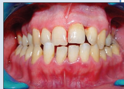
Figure 3: Clinical view of tooth 21 at the beginning of the second appointment. Note the occlusal disharmony.