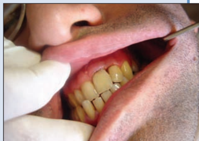
Figure 8: Labial view after restoration with light-cured composite.

portion, which had also involved the CEJ. There was no soft dentin, but exposed pulp was revealed during the excavation ( Fig. 5 ). The cavity was cleaned and shaped using a diamond bur, then restored with conventional glass ionomer ( Fig. 6 ).