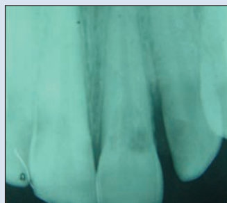
Figure 1: Periapical radiograph of tooth 21 showing a radiolucent area at the distal aspect of the tooth.