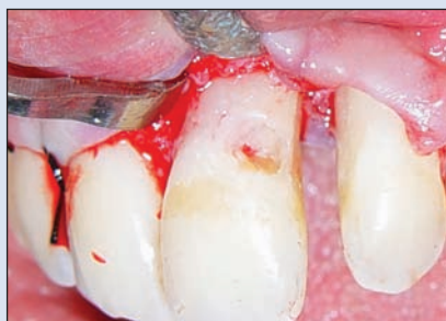
Figure 5: Pulp exposure.