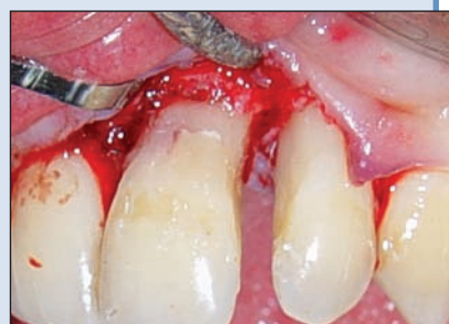
Figure 6: Restoration of the resorption defect with conventional glass ionomer cement.

Radiographically, this produces an irregular, diffuse radiolucency of non-uniform radiodensity. 9