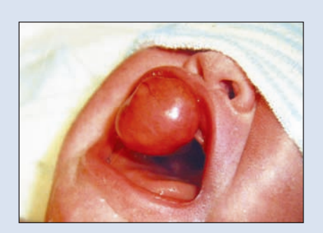
Figure 1: Appearance of a large mass of the oral cavity arising from the gingiva of the anterior maxilla in a neonate female.