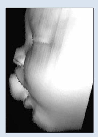
Figure 2: Three-dimensional CT scan showing the large mass protruding through the mouth.