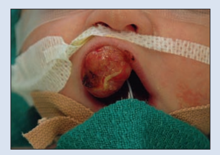
Figure 4: Lesion ready for removal in the operating room with patient's airway secured using an oral endotracheal tube.