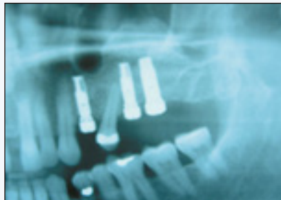
Figure 5: Implant placement following 4-month period of graft incorporation.