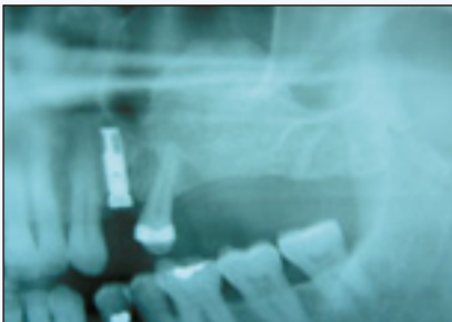
Figure 4: Postoperative view of left maxillary sinus immediately following sinus elevation and autologous bone augmentation using the Osteocore trephine technique.