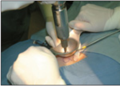
Figure 1: A Straumann Osteocore (Straumann AG, Waldenburg, Switzerland) motorized trephine is introduced to the anterior iliac crest, with guiding trocar retractor protecting the surrounding soft tissues.