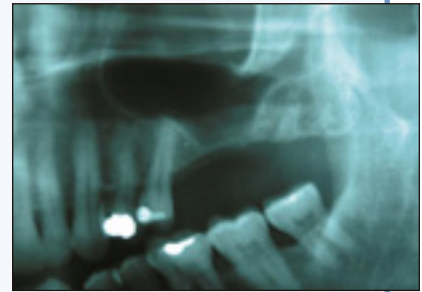
Figure 3: The left maxillary sinus before surgical elevation and autologous bone augmentation.