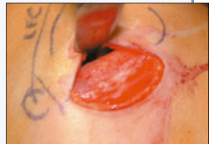
Figure 6: Right anterior iliac crest with exposure of medial cortex before harvesting a block corticocancellous graft.