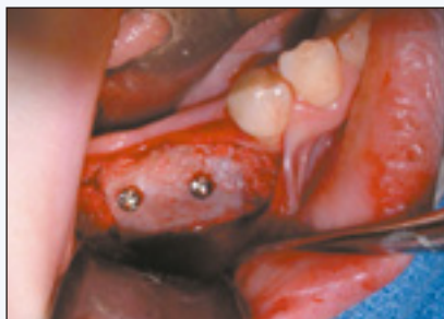
Figure 7: Block bone graft harvested from the iliac crest is rigidly fixed to the alveolar ridge with transosseous screws as an onlay graft to augment ridge width.