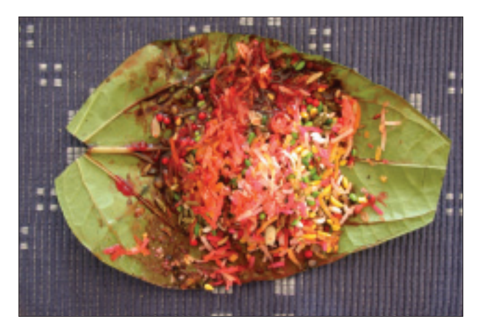
Figure 3: Sweeteners are added to children's paan.

ingredients should be listed so as to clearly delineate the following 3 basic categories: