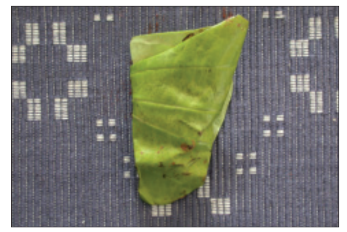
Figure 4: Once the ingredients have been placed on the betel leaf, the leaf is folded and the paan is ready to chew or suck.

tobacco is carcinogenic to humans, but there is inadequate evidence to conclude that the habit of chewing quid that does not contain tobacco is carcinogenic.<sup>4</sup> Countries with a high prevalence of areca nut use have higher rates of oral cancers than countries where this habit is not established.<sup>10</sup> However, some authorities believe it is the addition of tobacco, rather than the areca nut itself, that leads to these higher rates.<sup>4,11,12</sup>