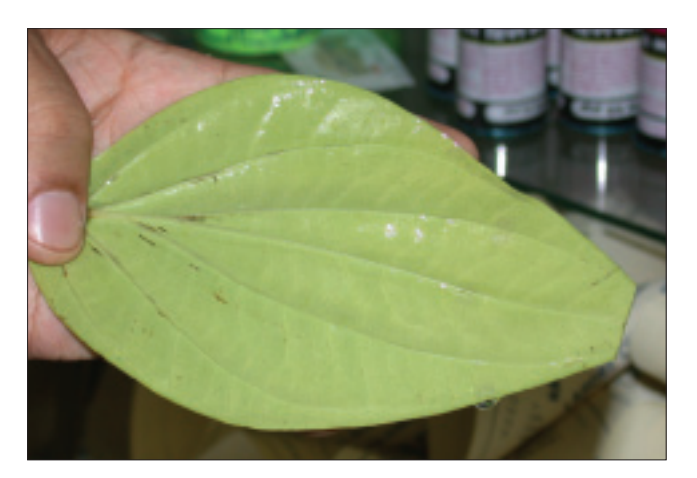
Figure 1: Leaf of betel (Piper betle).