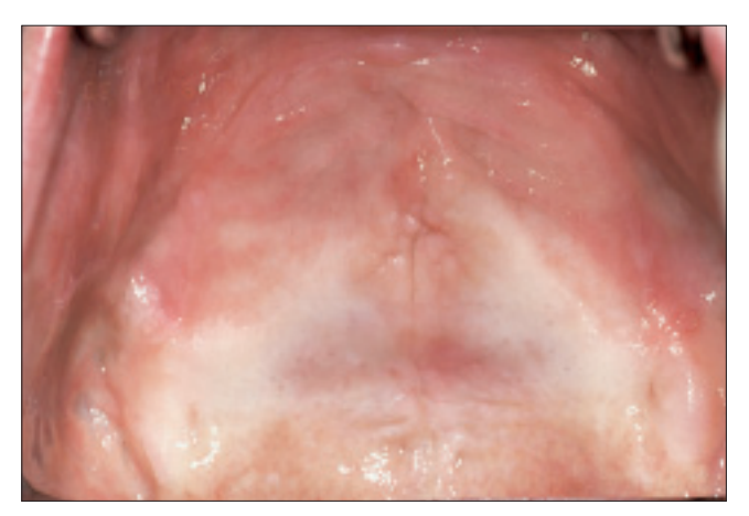
Figure 3: Class IV. No anterior or posterior vestibule.

fee for treatment and in identifying patients who are best treated by means of referral to a prosthodontist.