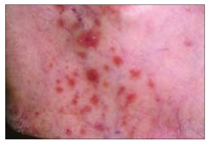
Figure 1: Cutaneous lichen planus on the flexor surface of the wrist. The condition presents as purple, polygonal, plaque-like lesions.