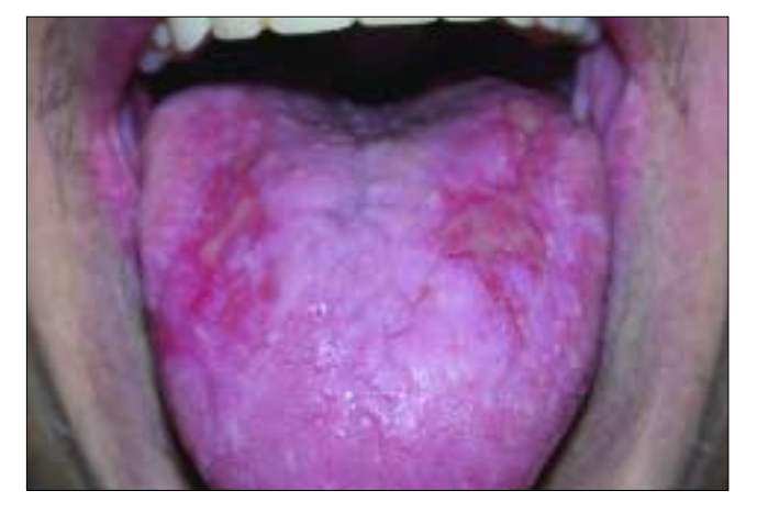
Figure 3: Plaque-type variant of reticular oral lichen planus with erosive areas involving the dorsum of the tongue.

mucosa, mucobuccal fold, gingiva and, less commonly, the tongue, palate and lips.