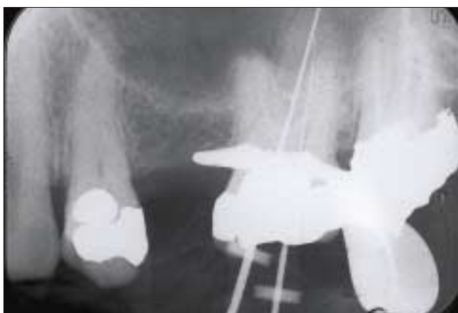
Figure 3: K-type files present in the 2 palatal canals.