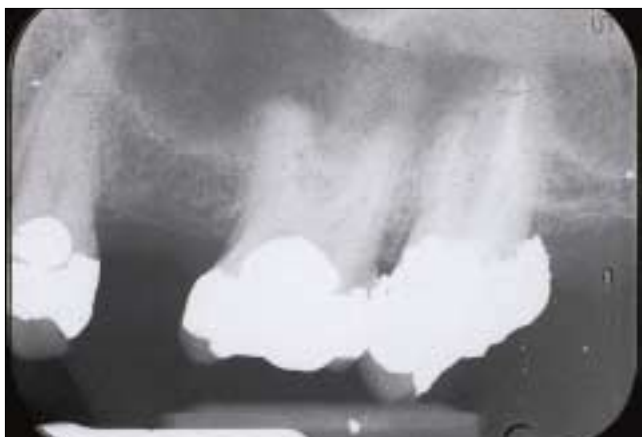
Figure 1: Preoperative radiograph of left maxillary first molar.