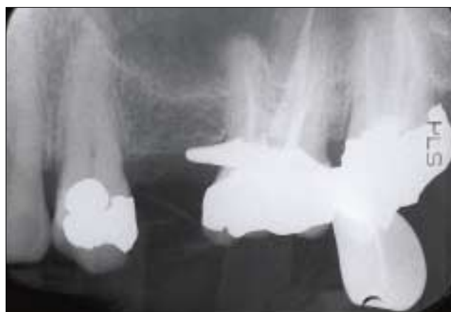
Figure 4: Immediate post-treatment radiograph displaying the unique palatal morphology.

palatal root of a maxillary first molar had 2 separate root canals. Cecic and others 15 reported a case with 5 canals (2 MB, 1 DB, and 2 palatal), in which the palatal canals bifurcated at midroot into 2 distinct canals. Martinez-Berna and Ruiz-Badanelli 16 described 3 cases of maxillary first molars with 6 canals (3 MB, 2 DB, and 1 palatal). Bond and others 17 also presented a 6-canal first molar (2 MB, 2 DB, and 2 palatal).