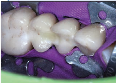
Figure 6: Light polymerized glass-fibre-reinforced composite.