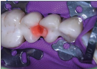
Figure 3: Acid etching material coating the cavity.