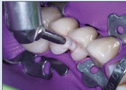
Figure 4: Application of the tribochemical coating.