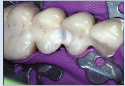
Figure 2: Clinical view of the fractured bridge showing the prepared cavity.