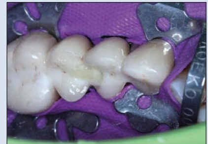
Figure 5: Placement of the glass-fibre bundle.