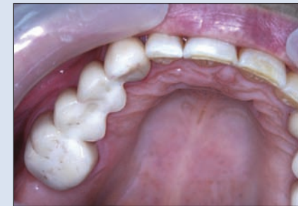
Figure 8: Final view of the restoration.

surface cracks, which compromise the strength of the zirconia core. 31