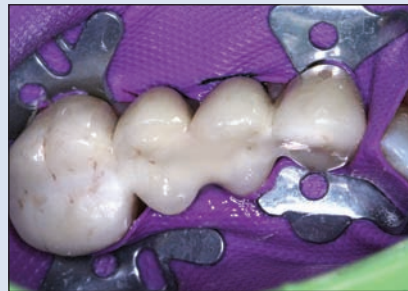
Figure 7: Composite application.