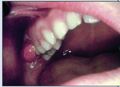
Figure 3: Pyogenic granuloma.