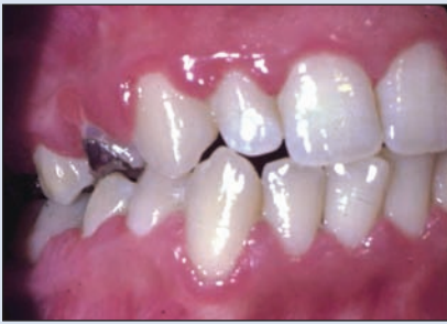
Figure 2: Pregnancy gingivitis.