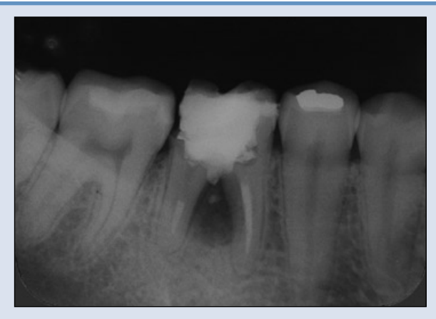
Figure 2b: MTA placed with temporary restoration.