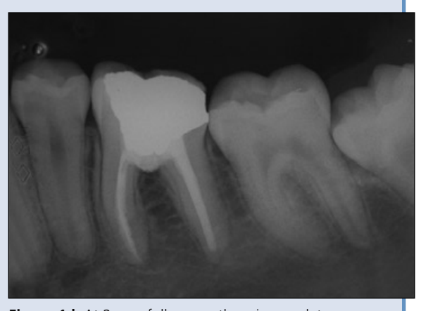
Figure 1d: At 2-year follow-up, there is complete osseous healing at the apex and the furcation.