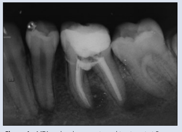
Figure 1c: MTA seal and new root canal treatment at 3month follow-up.