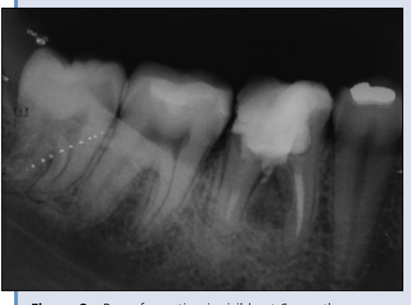
Figure 2c: Bone formation is visible at 6-month follow-up.