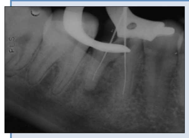
Figure 2a: Case 2. Periapical image of tooth 46 showing inadvertent furcal perforation, caused by drilling during access preparation for root canal treatment.