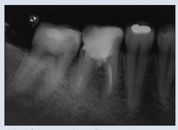
Figure 2d: Osseous repair can still be seen at the 5-year follow-up.

sodium hypochloride to control hemorrhage and to allow visualization of the perforation. White MTA-Angelus was applied in a manner similar to that described for case 1. The final radiograph obtained at the time of treatment showed evidence that the perforation had been sealed ( Fig. 2b ). Ten days later, the patient was asymptomatic. At the 6-month follow-up, bone formation was evident on radiography ( Fig. 2c ). A radiograph obtained 5 years after treatment showed that the osseous repair had persisted ( Fig. 2d ).