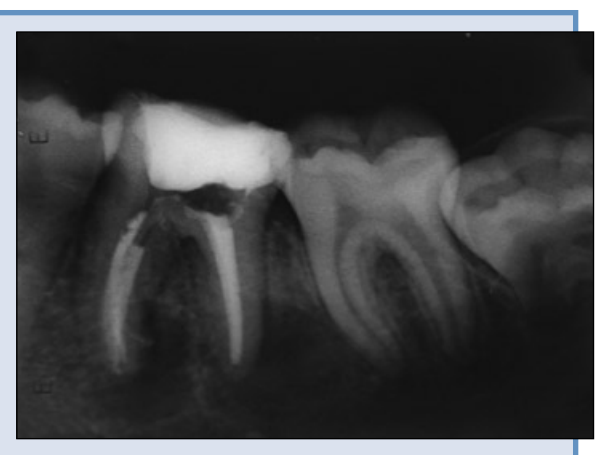
Figure 1b: Mineral trioxide aggregate (MTA) placed with temporary restoration.