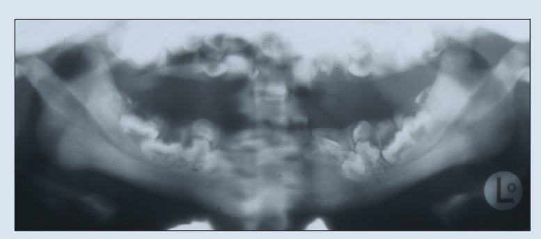
Figure 2: Panoramic radiograph in a patient with the infantile form of osteopetrosis.