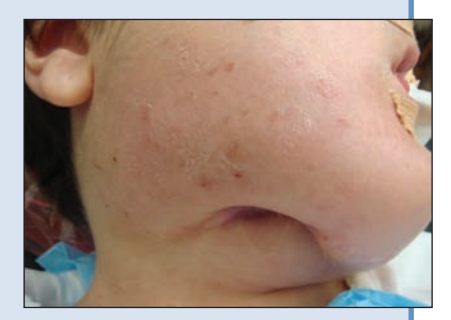
Figure 5: Healed fistula and defect at the inferior border of the mandible.

involves diminished osteoclast-mediated skeletal resorption.<sup>1</sup> The number of osteoclasts is often increased, but as they fail to function normally, bone is not resorbed.<sup>2</sup> This defective osteoclastic bone resorption, along with continued bone formation and endochondral ossification, leads to cortical bone thickening and cancellous bone sclerosis.