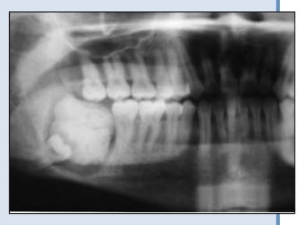
Figure 3: Panoramic radiograph showing the erupting odontoma and the impacted third molar, which was displaced to the disto-inferior region of the angle of the mandible.

A panoramic radiograph showed a uniformly dense rounded radiopacity (about 3.5 × 3.3 cm), distal to the mandibular right second molar and overlying the coronal portion of the mandibular right third molar, which was displaced disto-inferiorly (Fig. 3). A uniform, well-defined radiolucent halo surrounded the radiopacity except in the superior area where it erupted into the oral cavity. The right mandibular canal was displaced inferiorly. There was no evidence of any root resorption in the right mandibular second molar. Considering the clinical and radiologic presentations, a diagnosis of infected erupting complex odontoma was determined. Under general anesthesia, access to the mass was achieved via an intraoral approach and it was excised along with the impacted tooth, i.e., the mandibular right third molar (Figs. 4a and 4b). Histopathologic examination (Fig. 5) of the excised mass confirmed the diagnosis of complex odontoma.