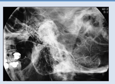
Figure 3: Sialogram of the left parotid gland with no evidence of sialolithiasis.

fenac and nabumetone) and low-dose nortriptyline — but only minimal beneficial effects were achieved. Lidocaine trigger-point injections on the left masseter resulted in reduction of pain to a minimal level; thus, injections were continued monthly for the following 4 months.