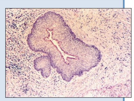
Figure 3: Section stained with hematoxin and eosin (200×) showing a satellite cyst.

reduced. Satellite cysts (Fig. 3) and epithelial remnants were observed in the connective tissue capsule.