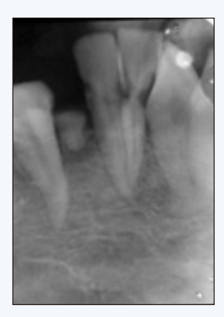
Figure 4c: Periapical radiograph showing the over-retained tooth 83.

pathology. In the absence of previous clinical and radiographic records, the exact cause of the transmigration could not be determined.