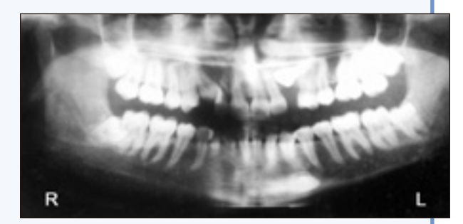
Figure 2: Panoramic radiograph showing transmigrated right canine below the apices of teeth 33 and 34. (Note: The patient was positioned too far back in the machine; thus, the anterior focal trough was not in the tomographic layer when the radiograph was taken.)