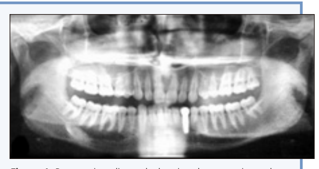
Figure 1: Panoramic radiograph showing the transmigrated tooth 33 apical to the mesial aspect of tooth 48.