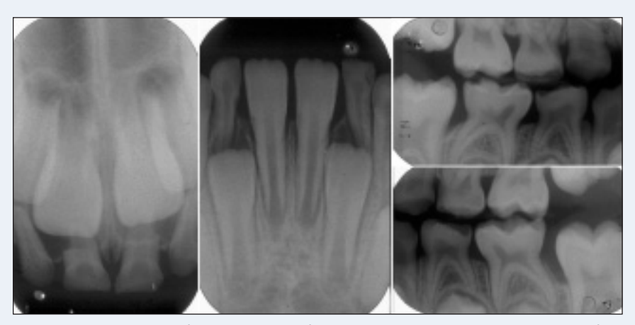
Figure 1c: Radiography confirms the wear and fractures in the primary teeth, as well as lack of damage to the supporting tissues.