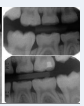
Figure 2c: Radiography confirms the pronounced wear on the primary teeth, the presence of a mesiodens and the absence of injury to the supporting tissues.