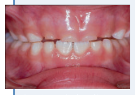
Figure 2a: Functional mandibular deviation without crossbite.