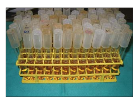
Figure 2: The instruments were placed into test tubes and stored vertically in racks in a 37°C incubator.