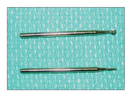
Figure 1: The 2 types of burs tested were the #701 fissure bur and the #8 round bur.