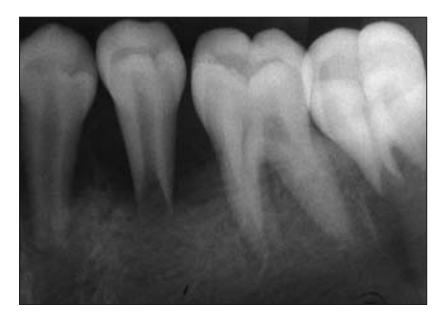
Figure 2: Periapical radiograph showing severe alveolar bone resorption around the lower second premolars.