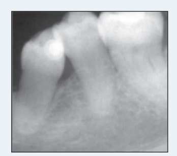
Figure 2e: Radiographic view of patient, age 40 years, 4 years after the mandibular left first premolar was orthodontically relocated.

as it included several extractions in childhood. She had no history of orthodontic treatment. Radiographs confirmed the presence of all permanent teeth excluding the 4 first permanent molars and the mandibular left second permanent molar. They also revealed the presence of 3 severely impacted mandibular premolars. Alveolar bone development was diminished in both mandibular premolar areas with tilting of adjacent teeth into these sites. In all 3 impacted premolars, root formation was complete. Adding to the complexity of the situation, the mandibular right second premolar was transversely impacted (Figs. 2a to 2c).