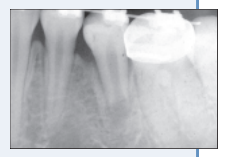
Figure 1f: Radiographic view of patient at age 13 years 3 months, showing continued normal root development of the formerly transversely impacted mandibular left second premolar.