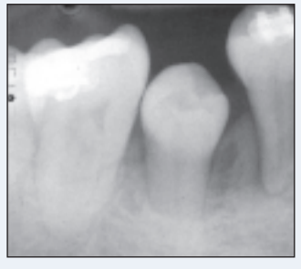
Figure 2d: Radiographic view of patient, age 40 years, 4 years after orthodontic relocation of the mandibular right first premolar and 7 years after initial presentation. Note no orthodontic force has yet been applied to the formerly transversely impacted second premolar, which erupted spontaneously.