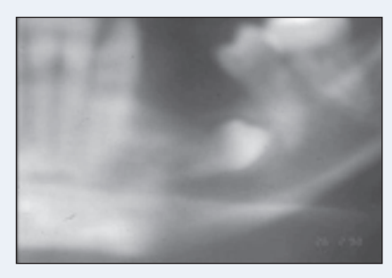
Figure 2c: Radiographic view of the left mandibular first premolar impaction at initial presentation.