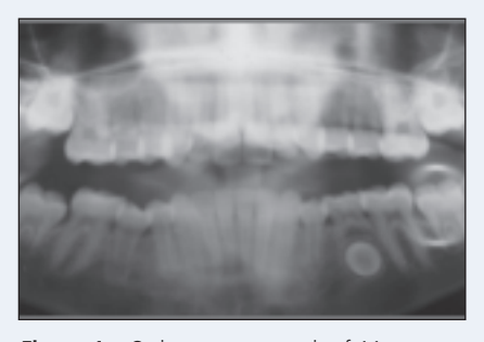
Figure 1a: Orthopantomograph of 11-year-old patient at initial presentation.