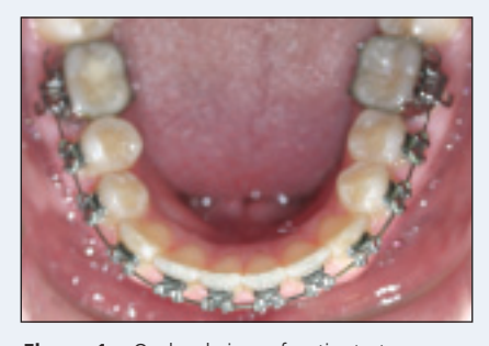
Figure 1e: Occlusal view of patient at age 13 years 3 months. The orthodontic relocation and alignment of the transversely impacted mandibular left second premolar is near completion.