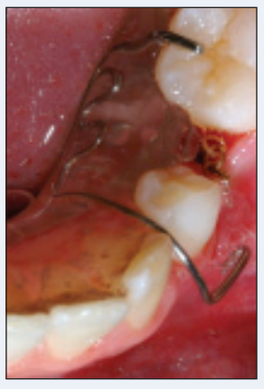
Figure 1c: Occlusal view of patient at 12 years of age, at initial orthodontic relocation of the impacted mandibular left second premolar using a removable appliance with elastomeric traction and a bonded eyelet on the unerupted premolar.