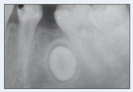
Figure 1b: Periapical radiograph of the transversely impacted mandibular left second premolar at initial presentation.