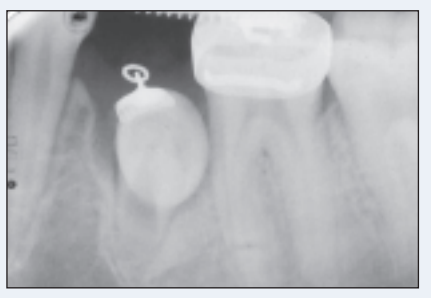
Figure 1d: Radiographic view of patient at age 12 years 4 months. A fixed orthodontic appliance is now in situ and root development of the impacted premolar is progressing normally.