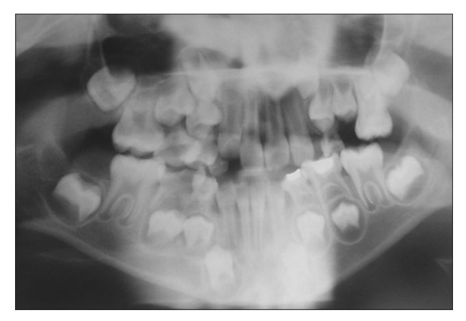
Figure 3: Panoramic radiograph at the first examination.