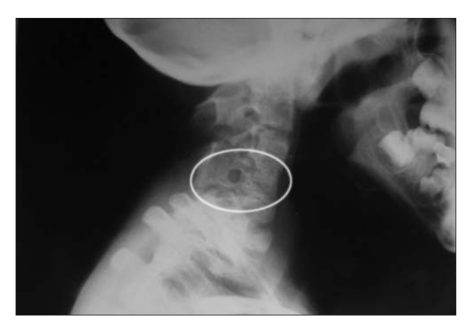
Figure 6: Radiograph showing fusion of cervical vertebrae.

problems can be reduced or avoided when hearing deficiency is recognized at an early age. 13,14