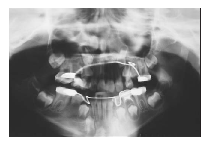
Figure 5: Panoramic radiograph at end of treatment.

Gunderson and others<sup>10</sup> distinguished 3 types of cervical vertebral fusion defect related to Klippel-Feil anomalies: type I – massive fusion of many cervical and upper thoracic vertebrae into bony blocks; type II – fusion of only 1 or 2 interspaces, usually C2-C3 or C5-C6, but there can be intrafamilial variability; type III – both cervical fusion and lower thoracic or lumbar fusion, often associated with multiple organ anomalies and subsequent neurologic compromise. A fourth type of Klippel-Feil anomaly has been suggested to be associated with sacral agenesis.<sup>3</sup>