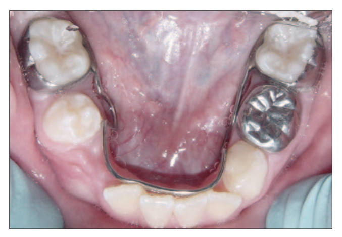
Figure 4b: Lower arch intraoral features at end of treatment.

correctly, using dentifrice and rinsing the mouth with fluoride. Sealants were applied to the permanent first molars and topical fluoride treatments were provided every 2 months.