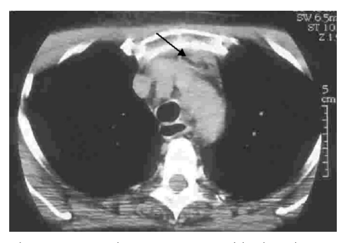
Figure 2: CT scan with intravenous contrast of the chest. The aortic arch is seen anteriorly with the trachea and esophagus posteriorly. Streaking of the fat plane between the aorta and sternum is indicative of infection (black arrow).