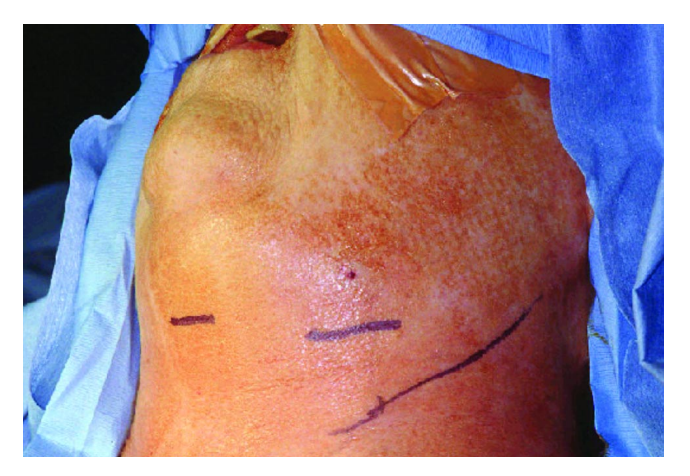
Figure 3: Planned incisions of the neck. The incision to the right is along the sternomastoid and was used for access to the mediastinum.

Thirty-six hours postoperatively a CT scan showed complete obliteration of the airway around the endotracheal tube (Fig. 6). On day 9 the swelling had resolved enough to allow extubation and patient discharge from the intensive care unit. The drains were removed on day 13 after surgery and were packed with one-quarter inch ribbon gauze until granulation was complete several weeks later. The patient made an uneventful recovery, except for an uncomplicated course of Clostridium difficile colitis and a bout of reversible hearing loss attributed either to the use of the gentamicin or to an otitis media resulting from prolonged nasal intubation. The patient has been followed for one year postoperatively with no further complications.