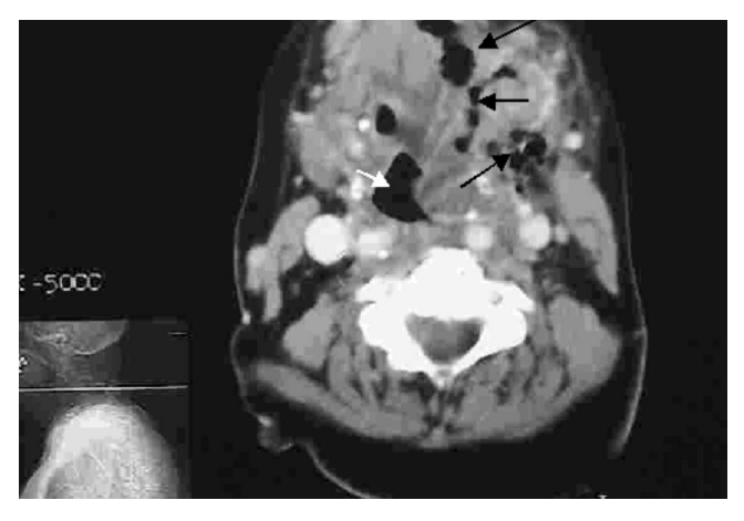
Figure 1: CT scan with intravenous contrast of the neck. The edge of the mandible is seen anteriorly and the vertebrae posteriorly. The airway (at the level of the epiglottis) is deviated severely to the left (white arrow). Gas bubbles are seen in the soft tissue to the right (black arrows).