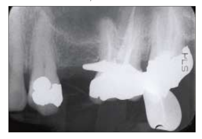
Figure 4: Immediate post-treatment radiograph displaying the unique palatal morphology.

several days prior to his appointment. The patient's medical history was noncontributory. After extensive clinical and radiographic examination, the maxillary left first molar was prepared for nonsurgical endodontic therapy. A preoperative radiograph was obtained ( Fig. 1 ). The patient received local anesthesia of 2% lidocaine with 1:100,000 epinephrine. A rubber dam was placed, and a conventional endodontic access opening was made.