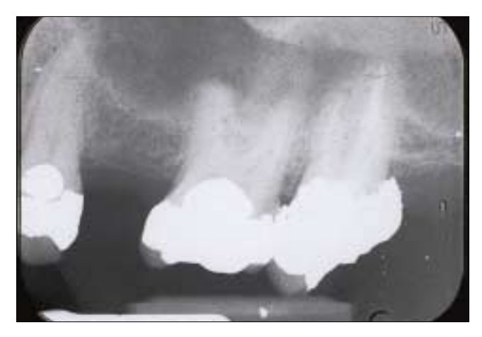
Figure 1: Preoperative radiograph of left maxillary first molar.