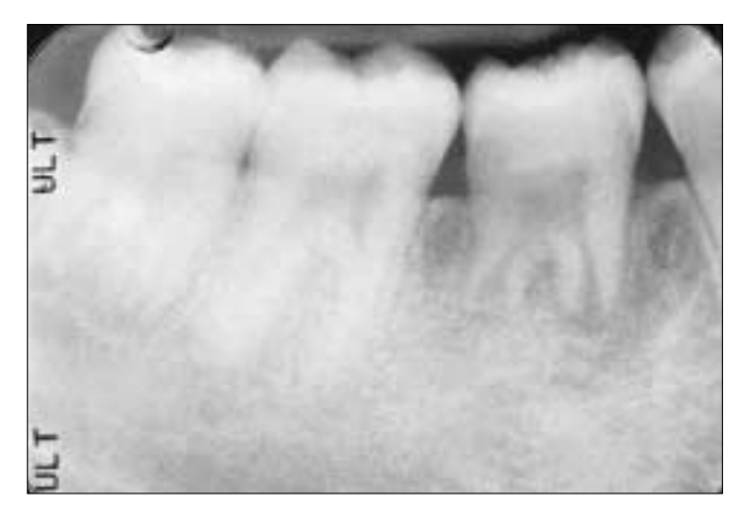
Figure 5: Six-month post-operative radiograph indicates patient has regained the supporting alveolar bone in the region of the tooth transplant and shows continued root development with the establishment of a periodontal ligament space.

hygiene. ^1 Patients may also be given perioperative and post-operative antibiotics. ^{1.4.6,14.17}