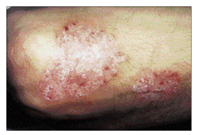
Figure 2: Psoriatic lesions on the patient's elbow.

In 1997, Younai and Phelan<sup>8</sup> reviewed the literature and presented a case of oral mucositis with features of psoriasis. Their