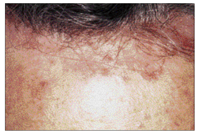
Figure 1: Psoriatic lesions on the patient's scalp. The patient's cutaneous lesions presented as silvery scales.

Microscopic examination (Fig. 4) revealed sections of mucosa surfaced with hyperparakeratotic stratified squamous epithelium with moderately developed rete pegs. Central portions of the specimen exhibited mild psoriasiform mucositis consisting of "test tube" rete pegs, thinning of the suprapapillary plate and engorgement of capillaries in the connective tissue papilla. There was mild exocytosis of inflammatory cells into the epithelium. The lamina