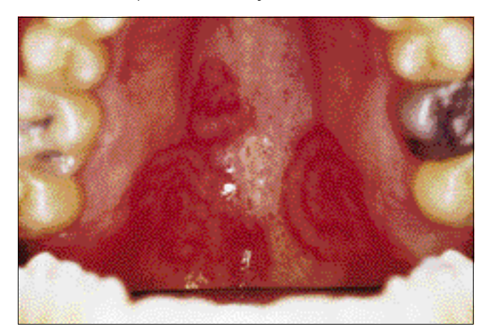
Figure 3: Clinical presentation of the patient's palate. The intraoral psoriasis presented as red serpiginous linear lesions on the posterior half of the hard palate.