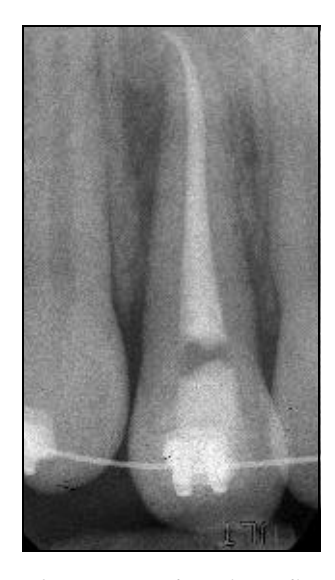
Figure 8: Post-obturation radiograph of maxillary left lateral incisor 1.2.

Extrapolation of results from adult periodontal therapy appears reasonable at the cellular level. However, its use for replantation is still experimental and should be under the guidance of research ethics committees. The outcome study currently under way will apply this information to a different injury (trauma) and to a different age group (children and adolescents). •