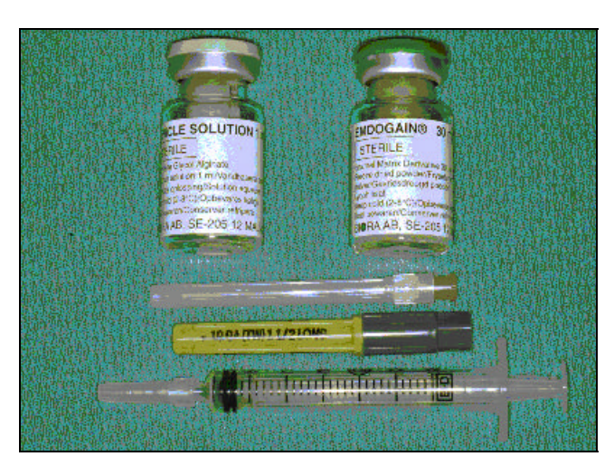
Figure 2: Emdogain is supplied as an aqueous vehicle and dried enamel matrix derivative that is reconstituted using the supplied canulae and a 3.0-mL syringe.

A 14-year-old boy presented with an avulsed maxillary right lateral incisor that was stored dry for one hour and then in Hank's Balanced Salt Solution for 30 minutes (total extra-alveolar