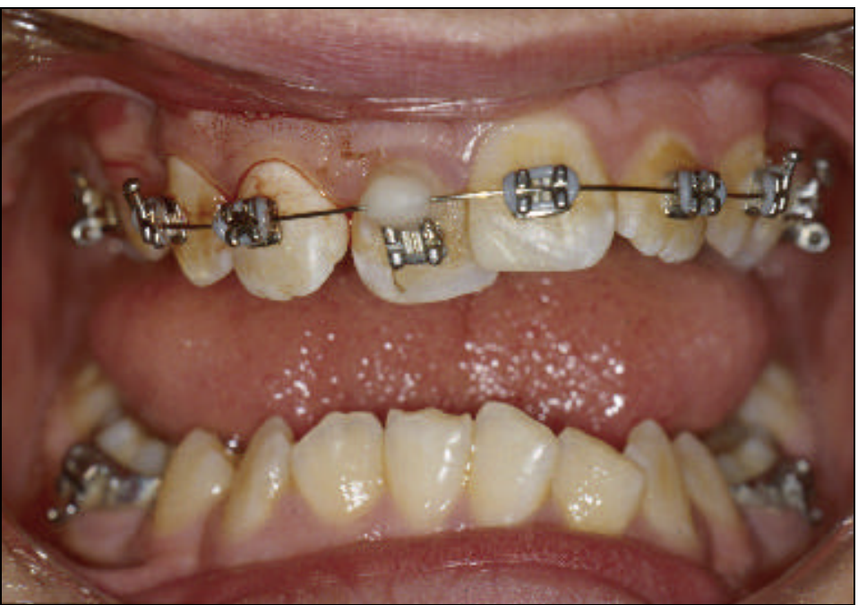
Figure 6: Maxillary right lateral incisor 1.2 immediately after replantation and stabilization.

time: 1.5 hrs). Visual and radiographic inspection of the socket confirmed complete avulsion of tooth 12 and the absence of any associated alveolar fractures ( Fig. 3 ). A radiograph of the tooth disclosed that root maturation was stage 6 ( Fig. 4 ). Next, access to the root canal was obtained with a high-speed handpiece, and the pulp was extirpated with a barbed broach ( Fig. 5 ). After gentle instrumentation with a #15 Hedström file, the root canal was irrigated with normal saline and dried with paper points. The access cavity was sealed with a light-cured, resin-modified glass ionomer material (PhotacFil, Espe America, Norristown, PA).