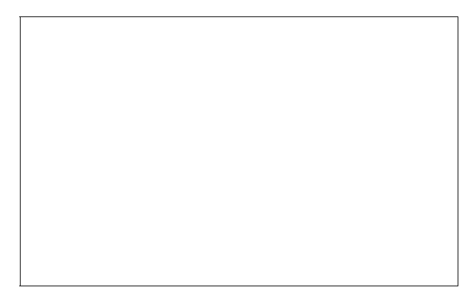
Figure 4: "compomers".

Shortly after the introduction of RMGICs, "compomers" were introduced to the market. They were marketed as a new class of dental materials that would provide the combined benefits of composites (the "comp" in their name) and glass ionomers ("omer"). These materials have two main constituents: dimethacrylate monomer(s) with two carboxylic groups present in their structure (Figure 4), and filler that is similar to the ion-leachable glass present in GICs. The ratio of carboxylic groups to backbone carbon atoms is approximately 1:8. There is no water in the composition of these materials. and the ion-leachable glass is partially silanized to ensure some bonding with the matrix. These materials set via a free radical polymerization reaction, do not have the ability to bond to hard tooth tissues,36 and have significantly lower levels of fluoride release than GICs. 37-45 Although low, the level of fluoride release has been reported to last at least 300 days. 46 The delayed (post-cure and post-water-sorption) acid-base reaction between sparse carboxylic groups and areas of filler not contaminated by the silane coupling agents is speculative<sup>47</sup>