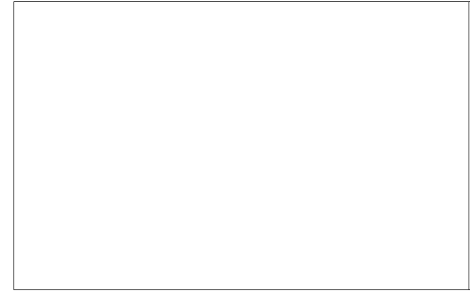
Figure 1: The effect of volume fraction filler ( V_i ) on the modulus of elasticity of composite ( E_c ) in relation to the modulus of elasticity of the unfilled resin matrix ( E_m ).

Dental composites are polymer-ceramic materials in which methacrylate and dimethacrylate monomers polymerize to form the matrix and glasses, ceramics or glass-ceramics are incorporated as spherical fillers. Among the most commonly used dimethacrylate monomers are 2,2-bis[4-(2-hydroxy-3-methacryloyloxypropoxy)phenyl]propane (BIS-GMA), 1,6-bis