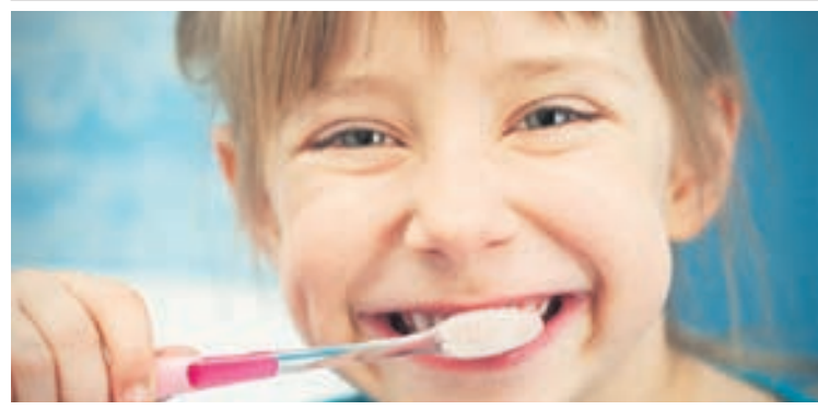
Soft, silicone-based brushes should be used at least two or three times a day. A dentist can help guide when to use a fluoride toothpaste and how much should be used.

colours or a favourite character, but in Dr. Antel's experience, a particularly successful approach is to make it a family affair. "If the parents and siblings all brush their teeth at the same time, even together, it models the haviour for the very young ones. Rather than being something imposed on the child, it's seen as 'something our family does.'