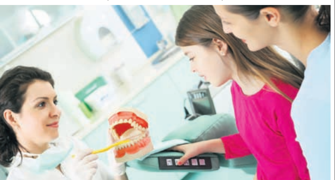
Childhood tooth decay can be prevented by ensuring that kids as young as one visit a dentist, who can look for early warning signs and educate parents.

These oral health interventions are being used in a study she's directing involving aboriginal populations in Canada, Australia and New Zealand. The "Baby Teeth Talk" study, involving up to 400 expectant aboriginal mothers over three years, will hopefully have an impact on oral health policy both locally and abroad, she says.