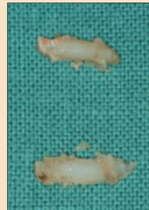
Figure 3: Extracted residual neonatal teeth 71 and 81.

once the child was out of her incubator and ready to be discharged home.