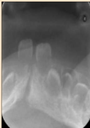
Figure 1: Mandibular anterior occlusal radiograph taken at age 17 days. Neonatal teeth 71 and 81 are present.