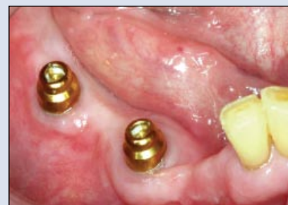
Figure 4: The locator abutments were tightened on the implants.

(4.1 mm in diameter, 12 mm in length; Straumann AG, Waldenburg, Switzerland) were placed without complication in the areas of the mandibular right second premolar and the right second molar using a one-stage surgical approach and a torque controller. The final insertion torque values recorded during placement of the implants were 35 and 40 Ncm, respectively. The mucosa was sutured after placement of the implants, with the healing abutments exposed. The placement of these 2 distal implants effectively changed the Kennedy classification of the partially edentulous arch from Class I (supported by tooth and tissue) to Class III (supported by tooth and implant). The patient's existing mandibular RPD was lined with soft-reline material after sufficient room had been established between the healing abutments and the interior acrylic surface of the denture, and the patient used the modified RPD during the osseointegration period.