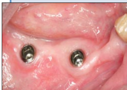
Figure 3: Three months after placement of the implants, the healing abutments were removed.