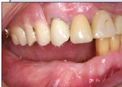
Figure 1: Intraoral view of the right mandible. The right lateral incisor, canine, premolars and molars are missing.

The initial treatment consisted of scaling, root planing and oral hygiene instruction. The patient's existing conventional RPD was duplicated with self-curing acrylic resin (Ortho-jet, Lang Dental, Wheeling, IL) to fabricate a surgical stent. The surgical procedure consisted of local anesthesia and crestal incision, followed by elevation of a full-thickness mucoperiosteal flap. After the implant sockets had been prepared ( Fig. 2 ), 2 implants