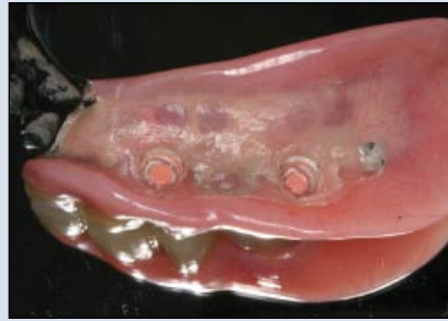
Figure 5b: Intaglio surface of the implant-supported RPD.