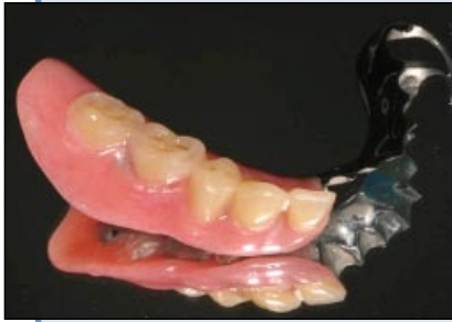
Figure 5a: Occlusal surface of the implant-supported removable partial denture (RPD).