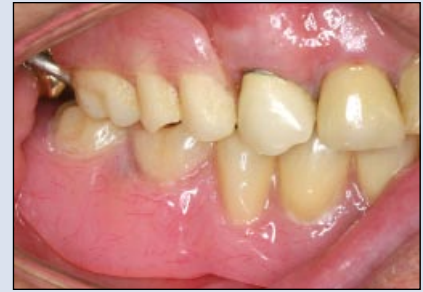
Figure 6: Intraoral view of the implant-supported RPD.

impressions were made with silicone impression material, and then the definitive maxillary and mandibular casts with 2 locator analogues were poured and mounted on a semiadjustable articulator (Whip Mix Co., Louisville, KY), using a facebow and a centric relation record. After the occlusal wax rims had been tried in on the record bases, the tooth arrangement was completed and heat-curing acrylic resin was processed in the laboratory (Fig. 5). The maxillary conventional RPD and the mandibular implant-supported RPD, with 2 plastic retentive parts seated on the locator abutments, were delivered the same day (Fig. 6).