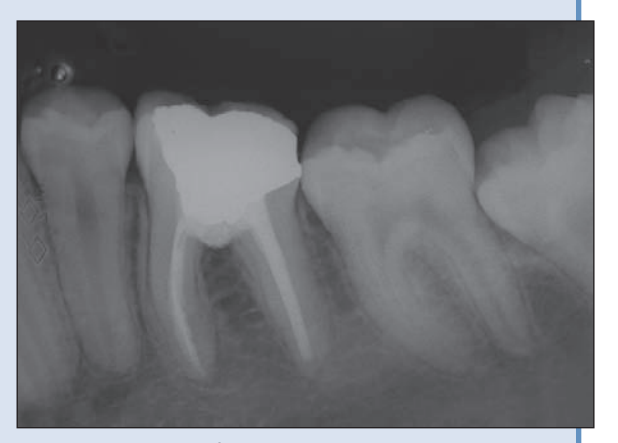
Figure 1d: At 2-year follow-up, there is complete osseous healing at the apex and the furcation.

In this article, 2 cases are described in which MTA was used to repair furcation perforation. These cases illustrate the potential benefits of MTA and its relative ease of use for management of perforation at easily accessed sites.