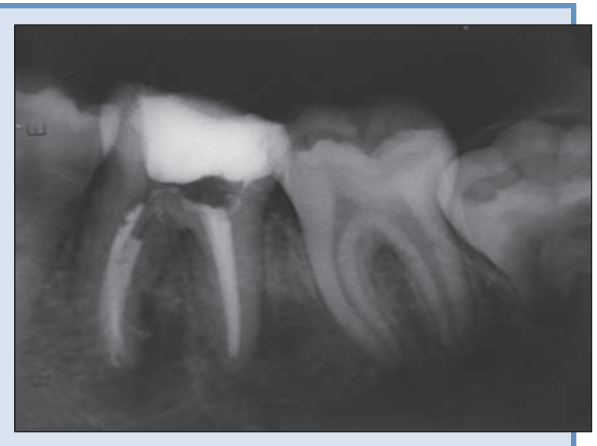
Figure 1b: Mineral trioxide aggregate (MTA) placed with temporary restoration.