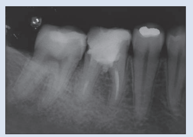
Figure 2d: Osseous repair can still be seen at the 5-year follow-up.

for root canal treatment along with repair of the perforation with MTA. The furcal perforation was confirmed by periapical radiography of tooth 46, which revealed osseous breakdown at the furcation (Fig. 2a). The root canal treatment was completed, and the pulpal chamber was then irrigated with 1% sodium hypochloride to control hemorrhage and to allow visualization of the perforation. White MTA-Angelus was applied in a manner similar to that described for case 1. The final radiograph obtained at the time of treatment showed evidence that the perforation had been sealed (Fig. 2b). Ten days later, the patient was asymptomatic. At the 6-month follow-up, bone formation was evident on radiography (Fig. 2c). A radiograph obtained 5 years after treatment showed that the osseous repair had persisted (Fig. 2d).