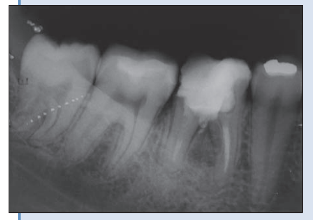
Figure 2c: Bone formation is visible at 6-month follow-up.