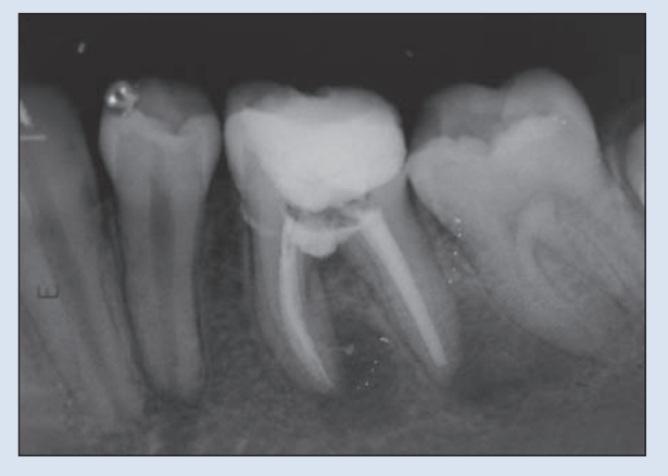
Figure 1c: MTA seal and new root canal treatment at 3-month follow-up.