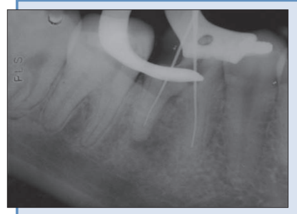
Figure 2a: Case 2. Periapical image of tooth 46 showing inadvertent furcal perforation, caused by drilling during access preparation for root canal treatment.