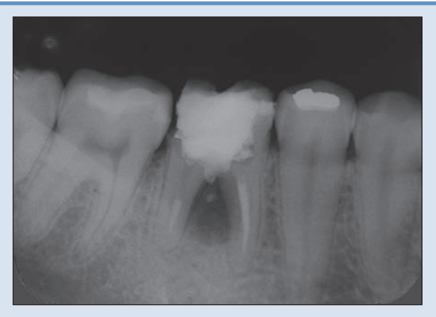
Figure 2b: MTA placed with temporary restoration.