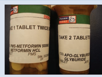
Figure 3b: The patient developed hyperglycemia as a result of long-term treatment with corticosteroids. The combination of corticosteroid-induced hyperglycemia and immunosuppression makes the management of head and neck infections even more difficult for the very complex group of patients with systemic lupus erythematosus.