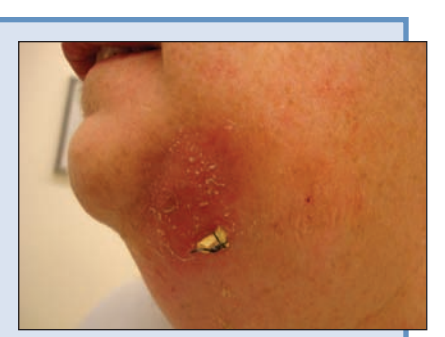
Figure 3c: Significant odontogenic infection. Note the presence of the submental drain and the minimal reaction in the area, despite the presence of significant odontogenic infection.

Figure 3b: The patient developed hyperglycemia as a result of long-term treatment with corticosteroids. The combination of corticosteroid-induced hyperglycemia and immunosuppression makes the management of head and neck infections even more difficult for the very complex group of patients with systemic lupus erythematosus.