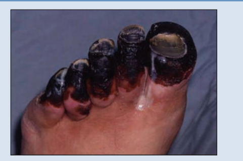
Figure 2: Gangrene caused by vasculitis. Vasculitis can lead to severe peripheral circulatory compromise and ultimately to gangrene, as seen in these toes.

induced triphasic colour changes of the hands and feet, referred to as Raynaud's phenomenon, are a far more common occurrence.<sup>5</sup>