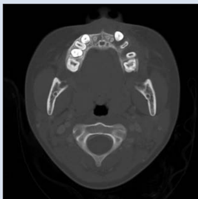
Figure 5: Computed tomography scan with axial cut showing the lytic lesion in the left maxilla involving the permanent left canine and premolars.