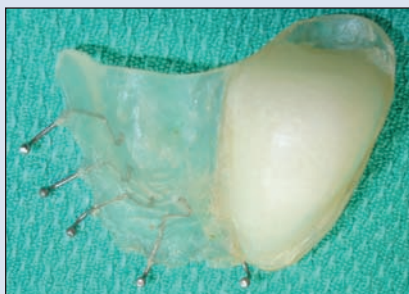
Figure 8: The temporary obturator keeps the maxillectomy wound dressed with packing and separates the oral and nasal cavities to allow the swallowing of solids and fluids without nasal regurgitation. The obturator also permits intelligible speech; it would otherwise have a hypernasal quality.