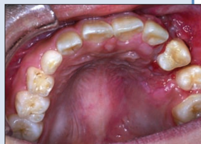
Figure 3: At the time of referral, the lesion had extended to involve the palatal aspect of the maxillary left first premolar.