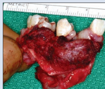
Figure 6: Specimen tissue from the partial maxillectomy resection containing the maxillary left lateral incisor, canine, first and second premolars and permanent first molar.

(Fig. 5). No evidence of regional or distant metastases appeared on plain radiograph films or CT and magnetic resonance imaging scans. The initial biopsies were re-evaluated by the department of pathology at the tertiary care centre, confirming the diagnosis of SCC. The stage of the tumour was estimated to be T1N0M0.