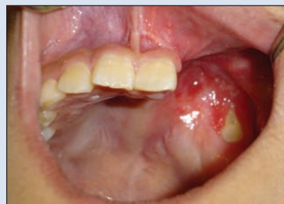
Figure 9: Intraoral defect resulting from excision of the lesion. This was ultimately reconstructed with an obturator bearing teeth.

the 18 patients receiving long-term follow-up, 14 were treated with surgery only, while the remaining 4 patients received adjuvant radiotherapy for cervical lymph node metastasis. After a follow-up of at least 5 years, 14 patients were disease free (mean age 17.9 years), 2 had died of the disease (the mean survival time from diagnosis in these 2 patients was 0.7 years) and 2 had died with no evidence of disease. The AFIP reports a good prognosis with adequate surgical treatment of these tumours. Zwetyenga and others 8 reported a treatment failure rate of 50% in 16 patients, but this was for epidermoid carcinoma of the oral cavity among patients who were < 20 years of age. In a recent review of Mayo clinic cases, Thompson and others 6 reported 3 more cases of oral SCC, 2 in the tongue and 1 involving the hard palate.