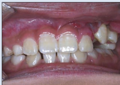
Figure 1: Ulcerative lesion on the labial aspect of the maxillary left canine and first premolar before incisional biopsy.