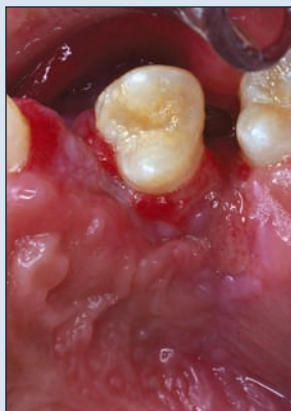
Figure 4: Close-up view of the lesion, which extends around the palatal aspect of the maxillary first premolar.