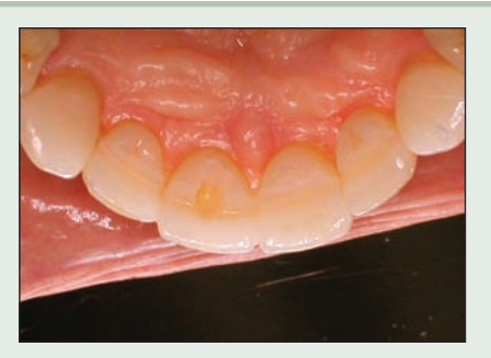
Figure 3: Occlusal view of the lingual veneers, with a slot preparation and deeper preparation of tooth 11.