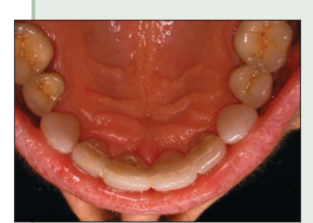
Figure 9: Occlusal view of the prosthesis in place.