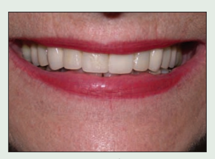
Figure 3: Frontal view of the removable partial denture.