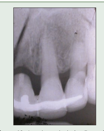
Figure 10: Anterior periapical radiograph showing the restoration in place.