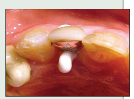
Figure 4: Excess Improv cement for an implant-supported porcelain-fused-to-metal restoration cemented on a gold alloy abutment.

ceramic inlays, onlays and full coverage restorations. Anecdotally, patients have not reported any postoperative sensitivity when Maxcem has been used.