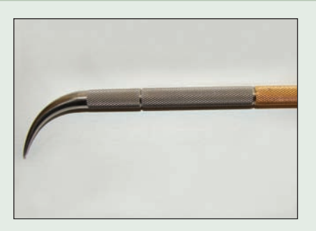
Figure 4: The Locator core tool.