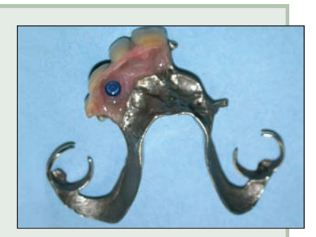
Figure 6: The blue (1.5-lb) male retentive element in the removable partial denture.

the friction matrixes in the Bredent attachment, the male retentive elements of the Locator attachment can be replaced easily, with minimal time and effort, with the Locator core tool (Fig. 4). The core tool in fact incorporates 3 tools in a single mechanism. The curved section of the tool, for removal of the male portion of the attachment, has a hook to catch and pull the nylon male liner out of the permanent metal housing. The middle section is the male seating tool, used to seat a replacement male portion into the metal housing. The third part of the tool is the abutment driver, for use in an implant application. Because of its retentive capacity, ease of use, ease of maintenance and ease of replacement of components, the Locator has been our attachment of choice in patients with overdentures.