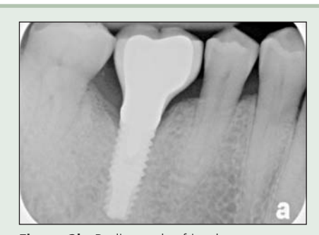
Figure 2b: Radiograph of implant crown at 6-month recall appointment showing an opening mesial contact.