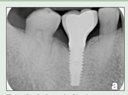
Figure 2a: Radiograph of implant crown at the time of crown placement showing acceptable mesial contact.