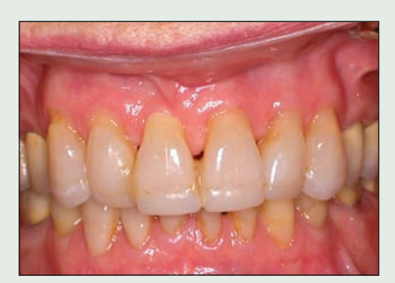
Figure 11: Follow-up photograph of the region 12 months after treatment, showing excellent healing and colour stability.

made it difficult to achieve an esthetically pleasing result, and use of the extracted crown solved many potential esthetic problems. When the tooth was extracted, the crown was shaped to create an ovate pontic and thus maintain gingival esthetics. Since both abutment teeth were periodontally sound, a fixed restoration was considered ideal.