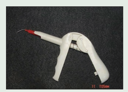
Figure 2: The C-R syringe.