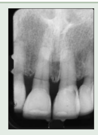
Figure 2: Radiograph of tooth 11 showing a horizontal root fracture.