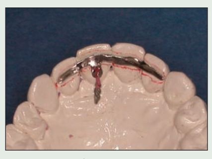
Figure 4: Metal frame cast so as to be short of all margins.