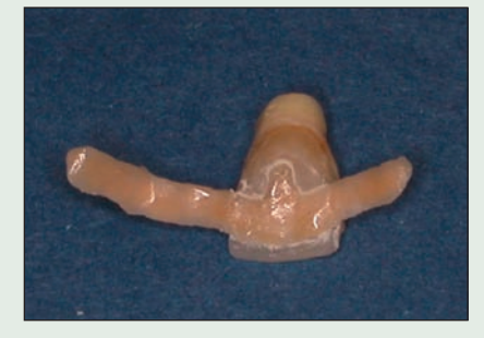
Figure 7: The extracted crown connected to the metal frame, ready for bonding to the abutment teeth.