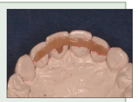
Figure 5: Metal frame laminated with porcelain to fit all margins; it is ready for cementation.