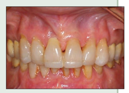
Figure 8: The prosthesis bonded in place; esthetics have been maintained.

into the fractured tooth allowed for more accurate indexing of the future prosthesis ( Fig. 3 ). A polyether impression was made, and a nonprecious metal frame was fabricated (Press Alloy, Swiss NF, Toronto, Ont.). This frame was designed to be short of the prepared margins ( Fig. 4 ). The frame was opaqued and waxed to create the ideal shape for the retainer (i.e., to fit the prepared channel) and porcelain was applied using the pressing method (SNF Press Ceram, Swiss NF) and finished ( Fig. 5 ). This porcelain-fused-to-metal frame was tried in, the fit was assessed, and the ceramic portion was etched with hydrofluoric acid (Pulpdent Corp, Watertown, Mass.).