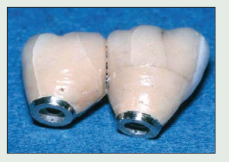
Figure 6: Attempts to add new porcelain to a prosthesis that has been in the mouth for an extended period often causes catastrophic failure of existing porcelain. Fractured porcelain must be stripped from the metal substructure and replaced.