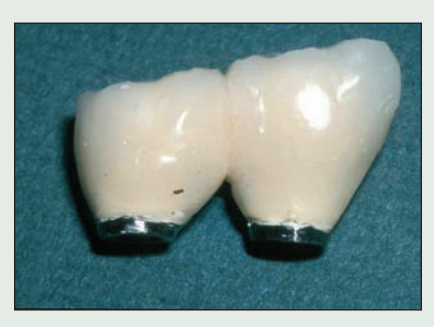
Figure 7: Rather than porcelain, laboratory-cured composite resin can be applied to metal and serve as a final restoration. In future, new material can be easily added intraorally.

screw-retained crown or a cemented crown using temporary cement or built-in design mechanisms allowing easy removal. The crown can then be removed from the mouth and the porcelain removed from its substructure and reapplied to a greater interproximal dimension. Note: new porcelain cannot be added to old porcelain that has been in the mouth for an extended period; therefore, porcelain must be replaced. Forward planning is useful, as one can design the final restoration from material that is easily bonded to so that future additions and repairs are better supported ( Figs. 6 and 7).