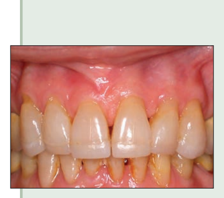
Figure 1: Buccal view of incisal extensions of the lingual veneers, which were placed to maintain new vertical opening.

A lingual groove-and-slot preparation was created through the cingula of the lingual veneers of the maxillary anterior teeth. A deeper preparation