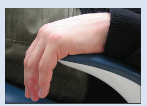
Figure 2: A relaxed hand is an indicator of muscular relaxation and calmness.

'guarding' doesn't really help. Tight muscles only make you tired and tense. You can just let your muscles relax. Let them go — just like when you're really tired and you finally lie down in bed and feel your whole body sink into the mattress — allow your body to sink into the chair — completely relaxed, soft, floppy, like a baby or a puppy (Fig. 2)."