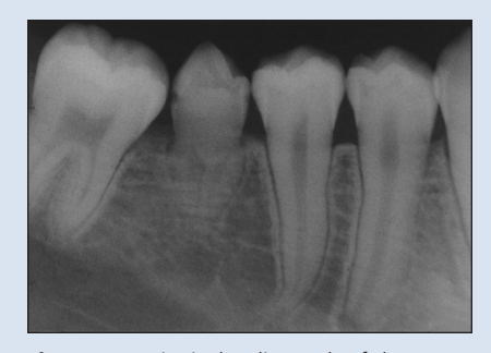
Figure 4: Periapical radiograph of the supplemental premolar taken 40 months after autotransplantation shows completed root growth with partial pulp obliteration.