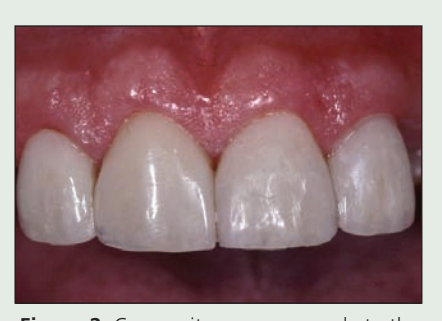
Figure 2: Composite cores are made to the future incisal edge position.