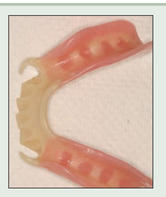
Figure 2: Acetal framework with acrylic bases.