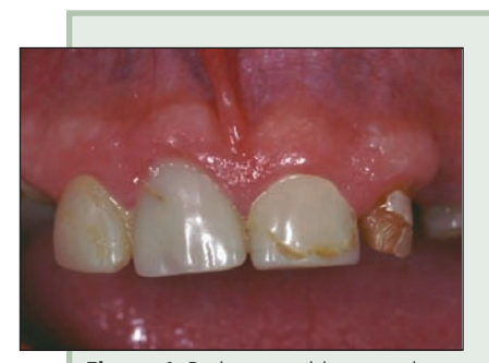
Figure 1: Patient requiring anterior reconstruction after tooth 13 fractured off at the gum line.

When no ferrule is present, the occlusal forces are resisted exclusively by the post, which may eventually fracture or loosen. Therefore, 2.0 mm of ferrule length is recommended as a clinical minimum under crown restorations for long-term post-and-core survival.