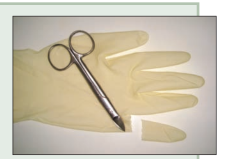
Figure 6: An alternative source for material to create a drain is the small finger of a nonlatex glove.