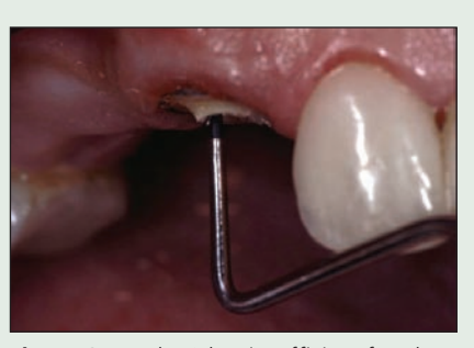
Figure 3: Tooth 13 has insufficient ferrule and will be restored with a bonded fiber post and composite core.