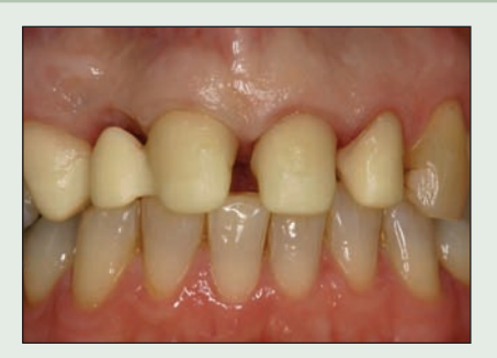
Figure 1: This Cercon framework for fixed partial denture and crowns has good connector dimensions and rounded line angles with optimal thickness for the veneering porcelain.