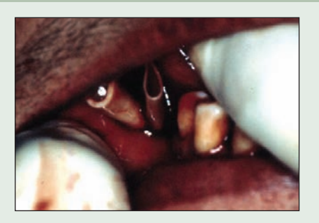
Figure 4: Drains secured and in position in the mandibular buccal vestibule.