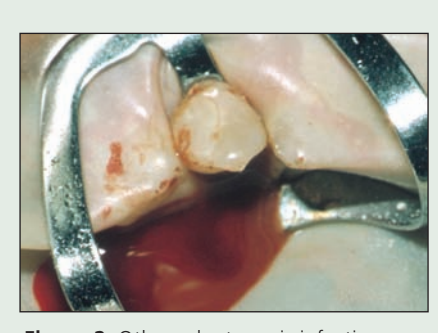
Figure 2: Other odontogenic infections may be amenable to drainage through an endodontic approach.