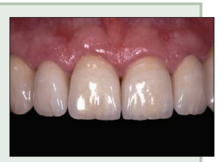
Figure 6: Final restorations have harmonious ginigval levels and good proportion.