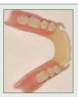
Figure 3: Acetal framework with interpenetrating polymer network teeth bonded to acrylic bases.

All subjects scored comfort higher for the flexible RPD, and all but 1 subject scored the function of the flexible RPD as superior to that of the cast-frame RPD (the exception was a mandibular RPD). Overall, 29 of the 30 subjects preferred the flexible RPD, which suggests that patient preference is the main factor driving the trend toward metal-free, flexible RPDs.<sup>9</sup>