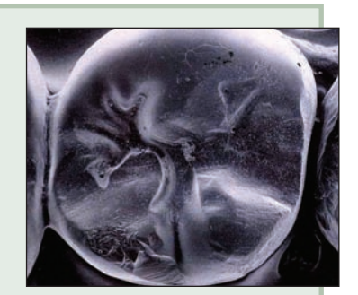
Figure 3: Edge chipping evident at 1 year is probably related to grinding adjustment.