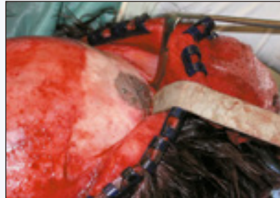
Figure 4: Fractures of the right supraorbital rim and anterior table of the frontal sinus fixed with titanium mesh and 1.0-mm fixation screws.