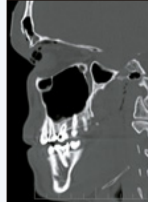
Figure 2b: Sagittal CT image of patient with right supraorbital rim fracture and concomitant fracture of the anterior table of the frontal sinus.