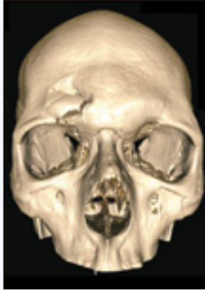
Figure 1: A 3-dimensional computed tomography (CT) image of patient with right supraorbital rim fracture.