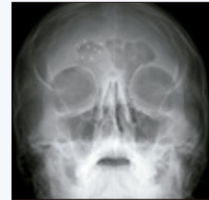
Figure 5: Postoperative Water's view of fracture reduction.

associated with high-energy impacts, motor vehicle collisions being the most frequently reported etiology. 1,18 Many other causes have been identified, including tire explosions, ruptured garage door springs, chain saws, high-voltage electric shocks, swinging objects and falls from high places. 1,3,9,10,18,19 Statistical information is unavailable for the frequency of nondisplaced, or isolated, orbital roof fractures, although a few case reports appear in the literature. 6,11,13