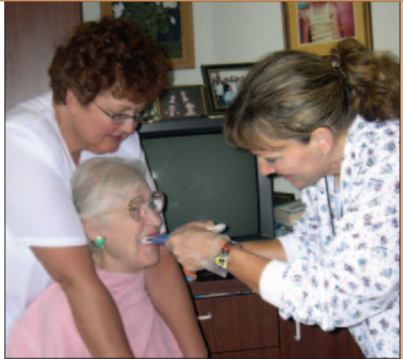
A nursing assistant uses the "hug" technique on an LTC resident who has difficulty cooperating. Two people work together in these situations to provide care.

Including CCAC as a primary player has been instrumental to the success of the HOHO project,