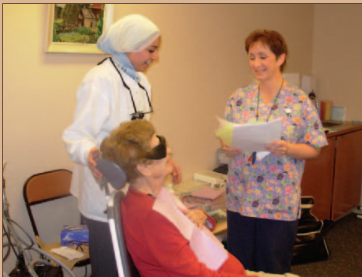
MultiGen dental professionals shown interacting with a patient.

In Ontario, MultiGen has 7 field teams operating in Ottawa/Gatineau, Belleville/Kingston, Peterborough, Barrie, Kitchener and London. In Alberta, the teams work in Calgary and Edmonton. Halifax will be the first location in Nova Scotia. MultiGen’s services also reach out to many rural communities within each region.