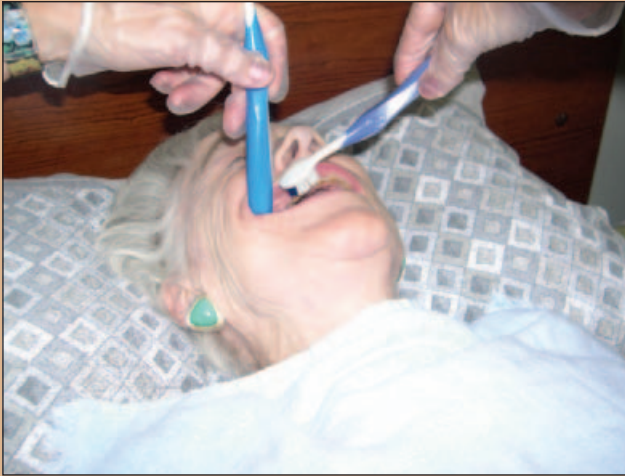
Oral care is administered to a bed-bound resident. The mouth is propped with a second toothbrush to reduce the risk of the caregiver being bitten.