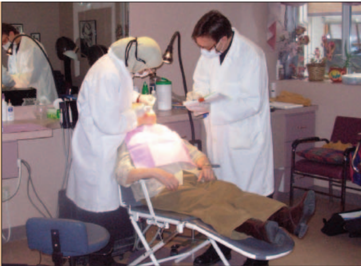
One of MultiGen’s field teams administering care at an LTC facility with mobile equipment.