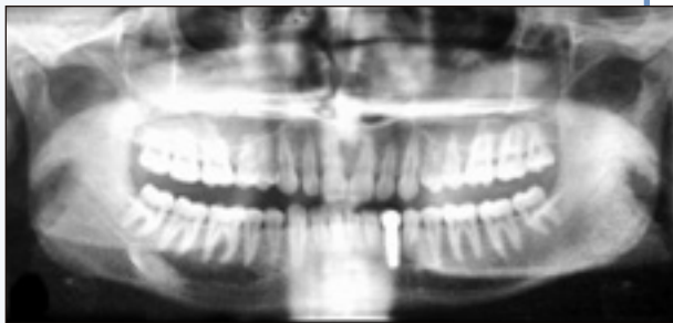
Figure 1: Panoramic radiograph showing the transmigrated tooth 33 apical to the mesial aspect of tooth 48.