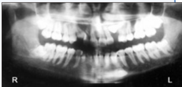
Figure 2: Panoramic radiograph showing transmigrated right canine below the apices of teeth 33 and 34. (Note: The patient was positioned too far back in the machine; thus, the anterior focal trough was not in the tomographic layer when the radiograph was taken.)