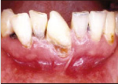
Figure 4a: Permanent right mandibular canine in the midline.