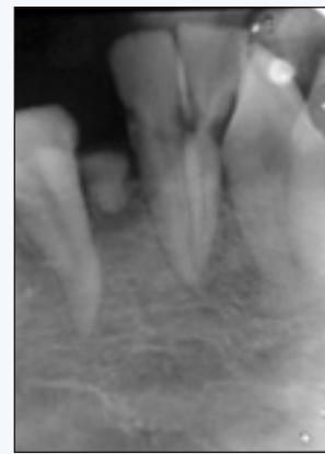
Figure 4c: Periapical radiograph showing the over-retained tooth 83.

with the tip of the crown leading the way. 9 The movement takes place along the path of least resistance. 4,9,11 The crown deviates to a more horizontal position and an abnormally strong eruptive force directs it through the dense mandibular symphysis. 12 Other local and pathologic factors implicated in the etiology of transmigration include premature loss of primary teeth and subsequent occupation of the space by adjacent teeth, unfavourable alveolar arch length, discrepancies in tooth size, fractures with displacement of tooth buds, odontomas and cysts. 4,11,12 The 3 cases of transmigration of impacted mandibular canines and 1 case of erupted transmigrated mandibular canine we report here had no associated pathology. In the absence of previous clinical and radiographic records, the exact cause of the transmigration could not be determined.