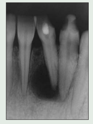
Figure 3: Appearance of the root canal after 2 weeks with calcium hydroxide (Ca(OH)<sub>2</sub>) intracanal dressing.