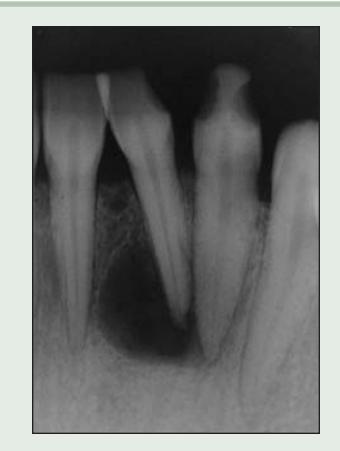
Figure 1: Mandibular central incisor with necrotic pulp, apical resorption and large periapical radiolucency.

Once the shaping procedure is completed, the canals should be thoroughly rinsed with sodium hypochlorite (NaOCl) to remove any organic