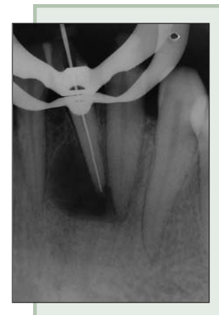
Figure 2: A radiograph is taken to determine working length.

components and then rinsed with a solution such as ethylenediaminetetra-acetic acid (EDTA), citric acid or MTAD root canal cleanser (BioPure, Tulsa, Okla.), to remove the smear layer. This extremely important step must be done before placement of the Ca(OH), dressing because it opens the dentinal tubules and facilitates diffusion of the dressing through the whole canal system up to the peripheral areas of the root. After suction and drying with paper points, the canal is ready to receive the intracanal dressing. The Ca(OH), powder should be mixed with the vehicle and then delivered into the root canal. A variety of techniques can be used to accomplish this, but lentulos are most often used to spin the Ca(OH)<sub>2</sub> into the root canal system. It is important to ensure that the dressing fills the whole space previously occupied by the pulp. To prevent leakage and re-infection, a cotton pellet should be placed in the pulp chamber and a temporary restoration used to restore the access cavity. This intracanal dressing should remain in the root canal for at least 2 weeks (Figs. 2 and 3). In the case presented here, the Ca(OH), medicament was left for 12 weeks because of patient scheduling. The decrease in size of the periapical lesion after this time is shown in Fig. 4. Removal of the intracanal dressing should be done by rinsing with NaOCl and a chelating solution, while instrumenting the root canal walls with files. Figure 5 shows the incisor after obturation.