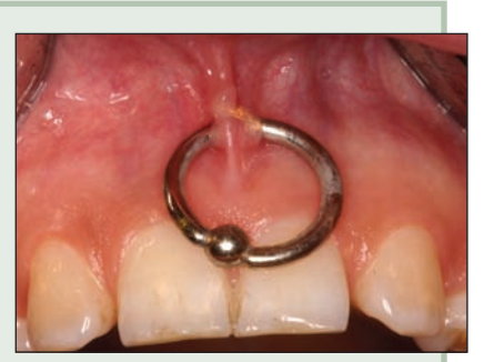
Figure 2: A maxillary labial frenulum ring 2 years after placement.