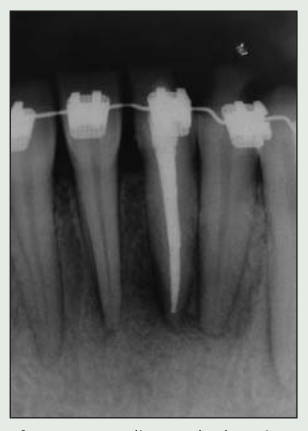
Figure 5: Radiograph showing canal obturation and bone healing 24 weeks after initiation of treatment.