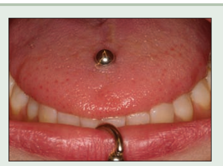
Figure 1 : A tongue barbell and lip ring 3 years after placement.

structure and chipping of porcelain crowns. In addition, there appears to be a positive correlation between the length of barbells used in tongue piercing and hard-tissue damage ( Fig. 3 ). It has been suggested, though not proven, that acrylic jewelry is less damaging to the hard tissues than metal jewelry ( Fig. 4 ). There are case reports of cracked tooth syndrome of the molar in patients with longer-stem barbells placed in the tongue, possibly due to movement of the long stem and the patient's penchant for clenching the