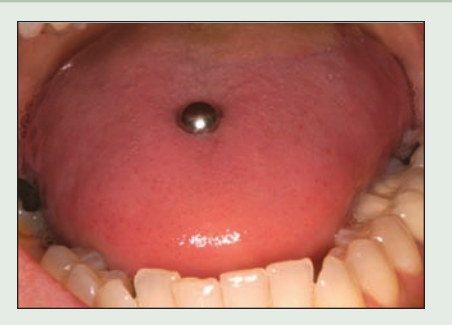
Figure 3: A tongue barbell 2 years after placement. Tooth 36 was fractured by the long barbell, which led to the need for endo-dontic therapy and a crown.