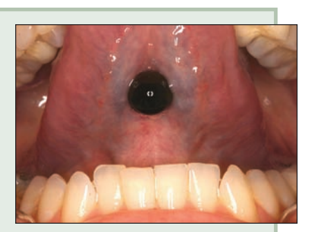
Figure 4: It has been suggested that acrylic balls on tongue barbells (rather than metal balls) will cause less trauma to the hard tissues.

dorsal cap between the teeth.<sup>4</sup> Possible preventive measures include removing the device, placing a shorter bar to prevent biting, and use of a night-guard or splint.