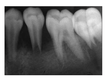
Figure 2: Periapical radiograph showing severe alveolar bone resorption around the lower second premolars.