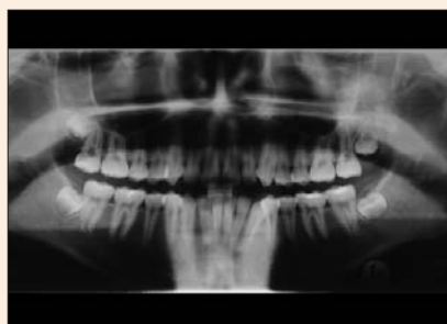
Figure 7: After 3 years of follow-up, a panoramic radiograph shows a normally pneumatized left maxillary sinus with no signs of recurrence.

that was occasionally draining, the parents opted for long-term observation. The drainage progressively worsened until the patient found it intolerable and requested removal of the lesion. Serial assessments were conducted to ensure that the patient was not lost to follow-up and that the related structures near the lesion were growing and developing normally.