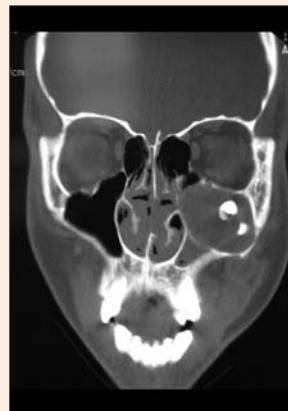
Figure 3a: Computed tomography image (coronal view) showing the lesion occupying most of the left maxillary sinus.