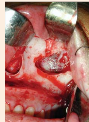
Figure 5: The anterior wall of the left maxilla is exposed and removed. A separate bony wall is removed to gain access to the bony cavity of the lesion.