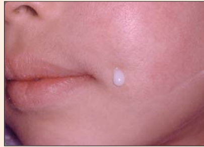
Figure 1: Drainage of a milk-like fluid from the left nasolabial groove.

Histologic sections revealed bone, developing teeth and a stratified squamous epithelium lining the lumen of the bony and soft-tissue cavities. Postoperative healing was uneventful and neither the lesion nor the fistula has shown any clinical or radiographic signs of recurrence in over 3 years of follow-up (Fig. 7).