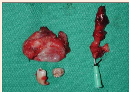
Figure 6: Teeth with the excised bony and soft-tissue specimens.