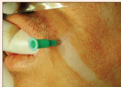
Figure 4: A catheter is threaded through the cutaneous opening of the fistula into the lumen of the lesion in the left cheek.