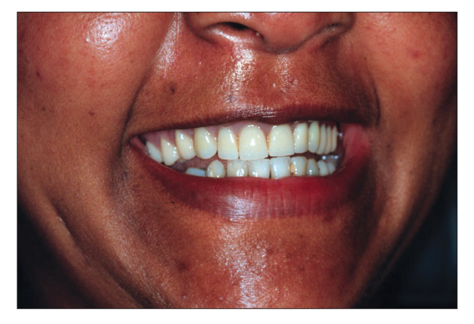
Figure 2: A 6-month follow-up photograph showing good esthetic result.

The acquired form of double lip may be secondary to trauma and oral habit, and may develop in association with Ascher's syndrome,<sup>2,7</sup> which consists of the triad blepharochalasis, nontoxic thyroid enlargement and double lip. The first case of double lip and blepharochalasis was reported in 1909,<sup>2</sup> and the association of these findings with thyroid enlargement was noted by Ascher.<sup>10</sup> It is not clear whether thyroid enlargement is a consistent or necessary feature of the syndrome.<sup>3</sup> The lip becomes enlarged in