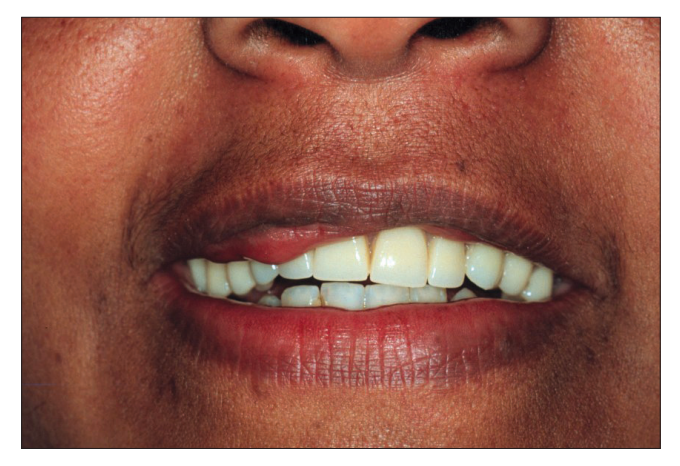
Figure 1: Initial aspect of the unilateral upper double lip.