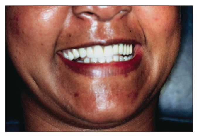
Figure 3: An 18-month follow-up photograph showing stable esthetic result.

The condition, also referred to as macrocheilitis<sup>4</sup> or hamartoma,<sup>8</sup> has no predilection in terms of race or sex. The congenital form of double lip is thought to arise during the second or third month of gestation from a persistence of the sulcus between the pars glabrosa and the pars villosa of the lip.<sup>9</sup> Although present at birth, the congenital condition may become apparent only after eruption of the teeth. Treatment of double lip is surgical and becomes necessary for cosmetic reasons, as in the present case, or if it interferes with speech or mastication. Recurrence has not been observed.<sup>9</sup> In the current case, no recurrence occurred in over a year of follow up.