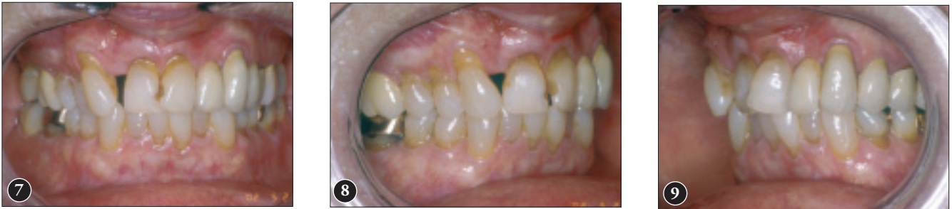
Figures 7 to 9: Intraoral view of healed soft tissue after removal of tooth 12 ( Fig. 7 ). The porcelain-fused-to-metal crowns on tooth 16 ( Fig. 8 ) and tooth 26 and the 3-unit cantilevered fixed prosthesis ( Fig. 9 ) had been placed earlier.

Study models were redone and a diagnostic wax-up presented to the patient for her approval. The primary concern at this point was the degree of tooth reduction that was needed and the potential impact on pulpal health.