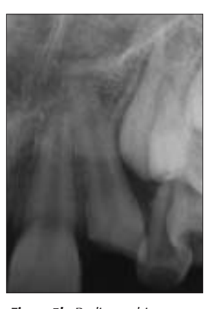
Figure 5b: Radiographic appearance after severe intrusion of tooth 22 in the same patient.