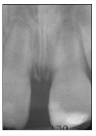
Figure 6d: Final radiographic appearance of the tooth after 6 weeks of treatment.

to facilitate PDL regeneration and thus inhibit replacement resorption. One group is involved in a prospective outcome case series,<sup>27</sup> while others have undertaken animal studies<sup>28</sup> and described unconventional applications.<sup>29</sup> It is speculated