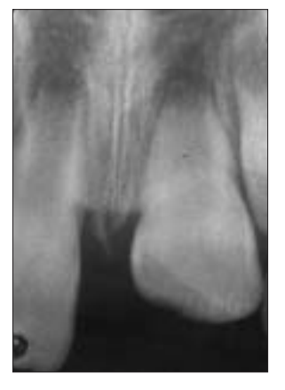
Figure 6b: Radiographic appearance of intruded tooth 21 in the same patient, also at the time of initial presentation.