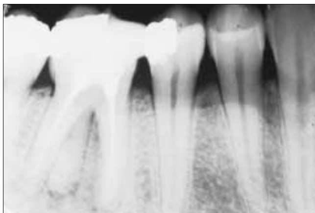
Figure 1: Preoperative radiograph shows that the right mandibular permanent first molar (tooth 46) has an additional distolingual root and that its root canal has not been treated endodontically.

working length. During the current presentation, the patient reported recent spontaneous pain around the apical area of the tooth, as well as pain upon mastication. Clinical examination of the right mandibular first molar revealed a disto-occlusal silver amalgam restoration and a mesio-occlusal resin composite restoration. The tooth was discoloured and was sensitive to percussion and palpation. A periapical radiograph (Fig. 1) showed that the tooth had a total of 3 roots; the 2 canals of the mesial root and the single canal of 1 of the distal roots had all been treated endodontically, but the canal of the second distal root had not been treated, probably because the dentist failed to identify its presence. The radiograph revealed radiolucency in the periapical area of the distolingual root and apparent widening of the periodontal ligament space of this additional root. Radiography also revealed double periodontal ligament (PDL) spaces in the mesial root. The apical portion of the distobuccal canal seemed to be infraobtured.