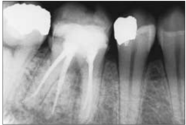
Figure 4: Radiograph obtained at 14-month follow-up. The tooth was asymptomatic. Double periodontal ligament spaces are visible in the mesial root, which suggests root bifurcation.