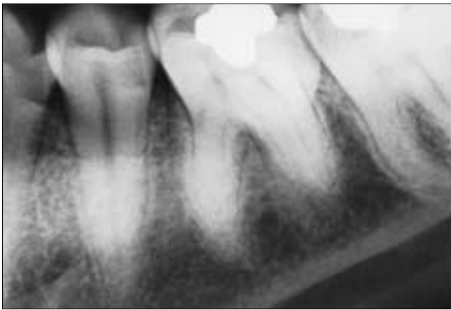
Figure 5: Periapical radiograph shows the left mandibular permanent first molar with an additional distal root. Double periodontal ligament spaces are visible in the mesial root of this tooth, which again suggests root bifurcation.

this canal was therefore left untreated. Eventual treatment success was achieved by endodontic therapy of this extra canal and re-treatment of the distobuccal canal.